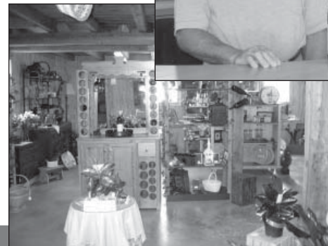
Left: The Petersen's refurbished barn makes a great winery, party room & gift shop