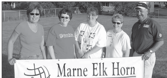
METC Relay for Life Team