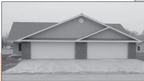
Construction is nearly complete on our 2-bedroom condos on Bornholm Street.

project and we have been very pleased with their work. But, my thanks won't stop there because there have been many contractors working on this project - local electricians, plumbers, painters, builders, decorators, heavy equipment operators, and more. These contractors have been a pleasure to work with and have done a quality job.